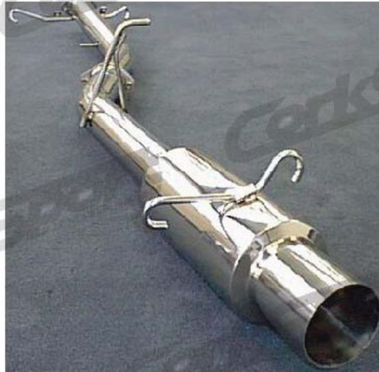
CorkSport Power Series Exhaust for the 86-91 RX-7 Install Instructions