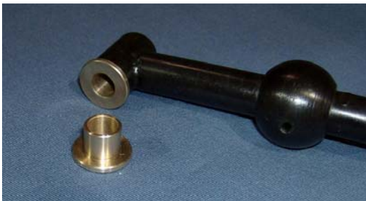
CorkSport Short Shifter and Bronze-Oil Bushings

A short shifter changes the pivot point to require less movement of the shifter to change gears in your car. Performance shifter bushings are replacement bushings made from stiffer material than stock to give a more direct and solid shift.